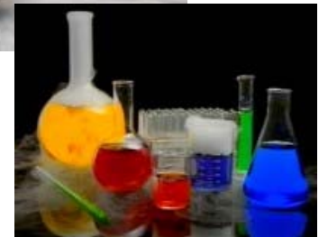
PRODUCT SELECTION CHART